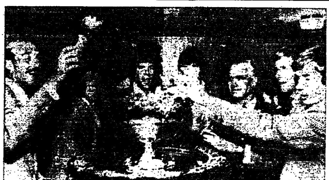
FILLING THEIR CUP—Members of the U.S. team and Gen. William Westmoreland, third from right, pour champagne into Davis Cup which they won Sunday.

Pittsburgh (3) BALTIMORE (11) Total 38 11 14 10